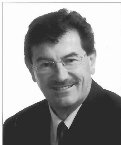
"Your Independent Candidate"

Polling Station: please refer to your Polling Card